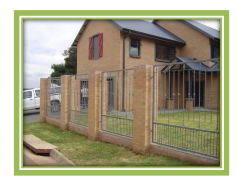
Chanté Villa 18