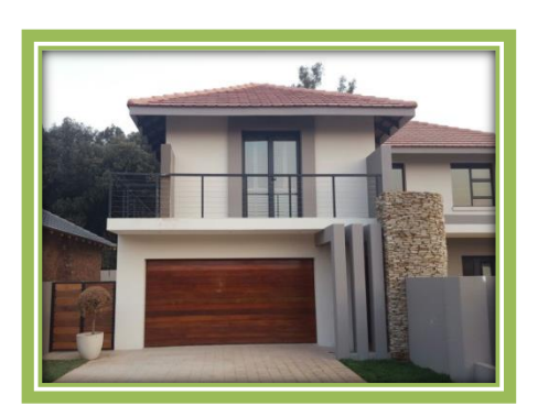
Stone Village 803

• The Company strives to keep its quality excellent and its resources available to its clients to keep a consistent track record.