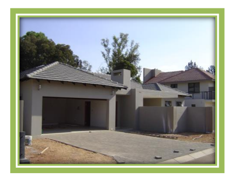
Stone Village 802

• The company wishes to grow at a steady rate and not to over extend itself and allow clients to suffer. The company is eager to grow to new lengths.